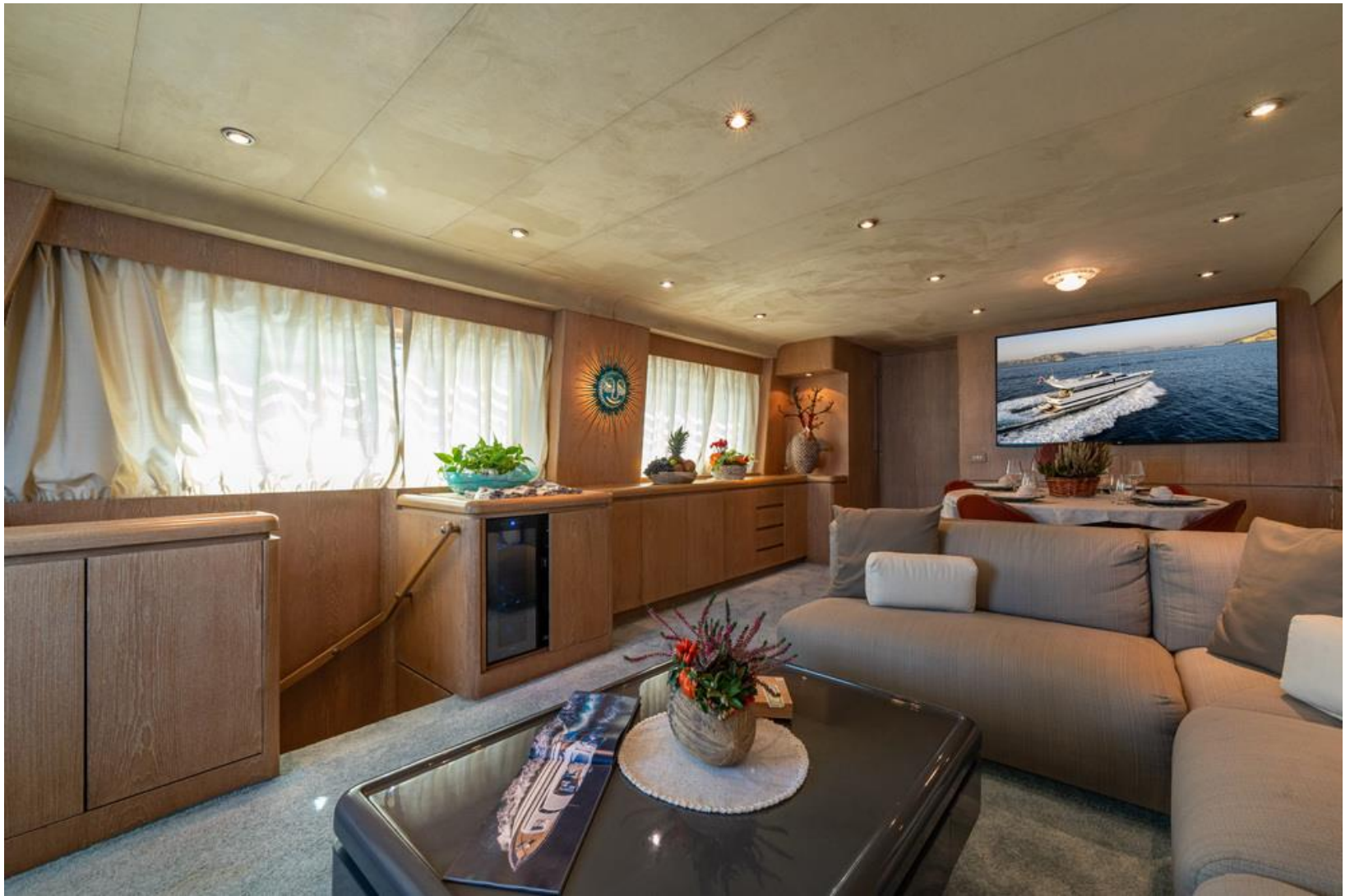
Saloon & Dining