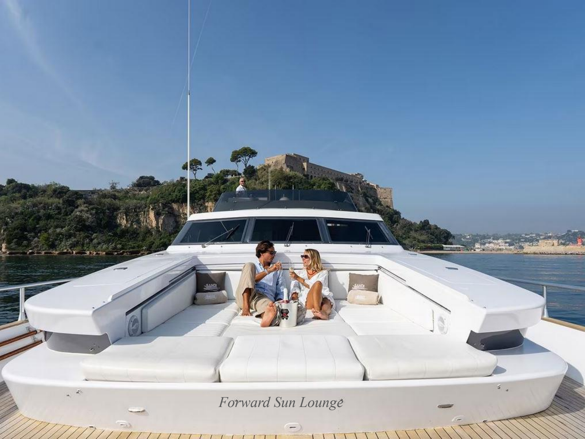
Forward Sun Lounge