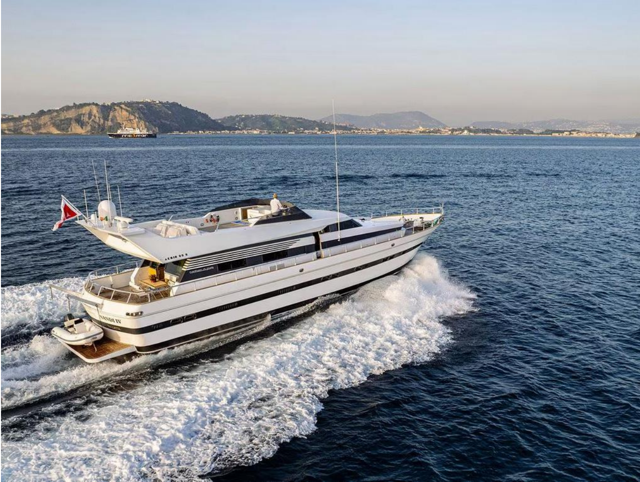
AKHIR 25S in navigation