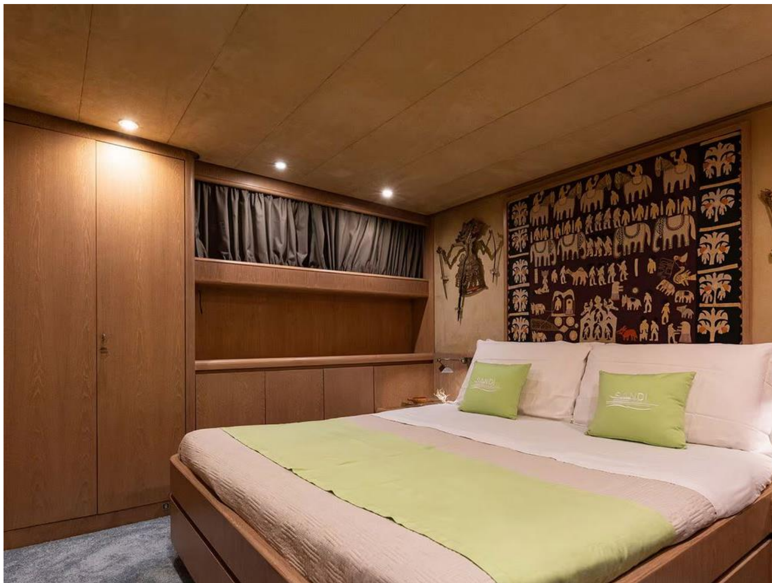
King VIP Cabin