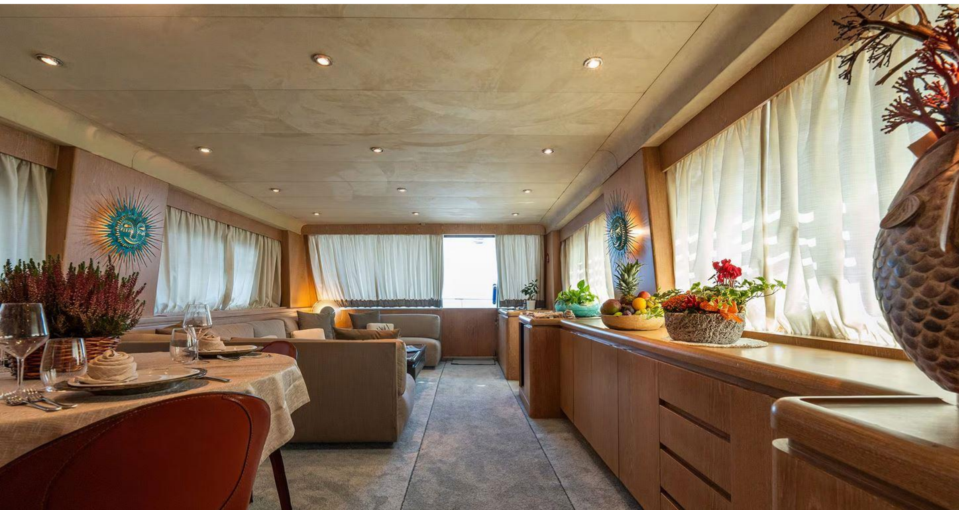
Saloon & Dining